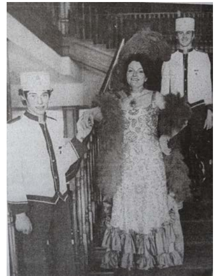
Taken at the Casino – publicity photo for "Hello Dolly" 1982