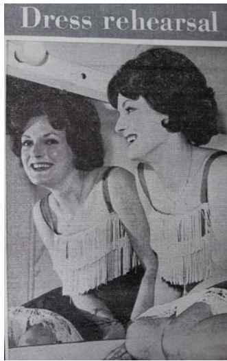
Taken at a dress rehearsal for "Showboat" 1964